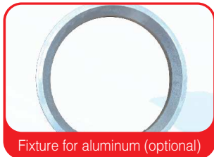
Fixture for aluminum (optional)