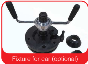
Fixture for car (optional)